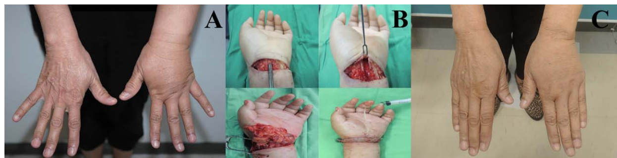
FIGURE 1 A, Preoperative photograph of a 51-year-old woman with left upper limb lymphedema and carpal tunnel syndrome. Patient underwent a simultaneous right gastroepiploic lymph node flap transfer to the left wrist and open carpal tunnel release. B, Intraoperative pictures of both procedures (above: carpal tunnel decompression, below: VLNT). C, At 16-month follow-up postoperative photograph (dorsal view) showed a significant circumference reduction rate of 31 and 35% at the wrist and hand level, respectively. In addition, patient reported improvement in the functionality of the hand and symptoms relative to carpal tunnel syndrome

Based on these promising results, patients with AUEL and concurrent CTS may benefit from this novel combination of two well-established procedures in a single-stage operation. Long-term studies will further identify the safety and efficacy of this treatment option and clarify whether lymphedema is a risk factor for CTS.